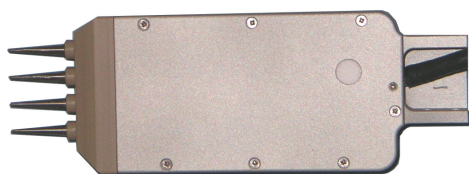
Figure 1. Picture of Thermal and Electrical Conductivity Probe.

All measurement functions (including several others outside the scope of this paper) were packaged in an aluminum enclosure that also served as the mechanical interface to the Phoenix Robotic Arm. Four metal needles served as the heated needles for the thermal properties measurements and also as electrodes for the electrical properties measurements (Figure 1). More details on the TECP design can be found in Zent et al. (2009a).